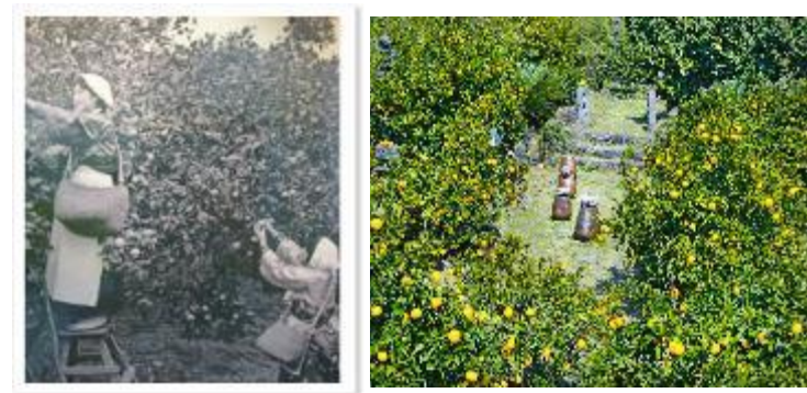
JEJU TANGERINE ORCHARD (LEFT**: 1910~1980, RIGHT: NOW)