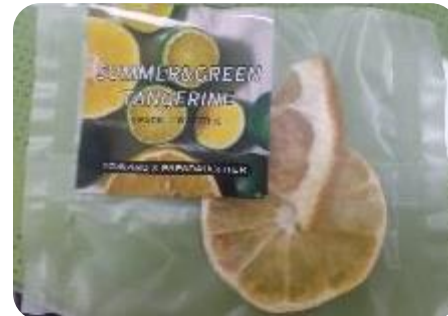
Dried green tangerine