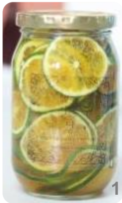
Syrup of Jeju green tangerine