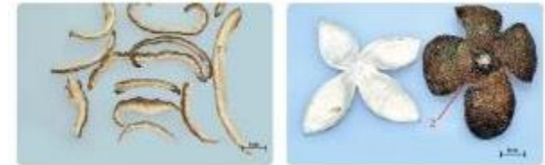
DRIED PEEL OF GREEN TANGERINE*