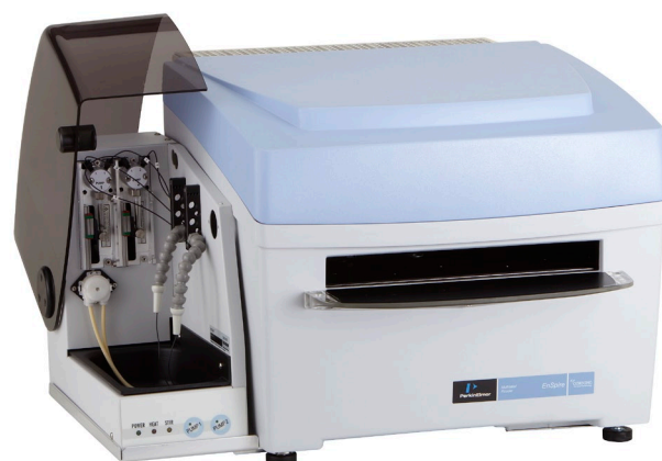
EnSpire with Dispenser